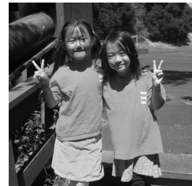
Make new friends!