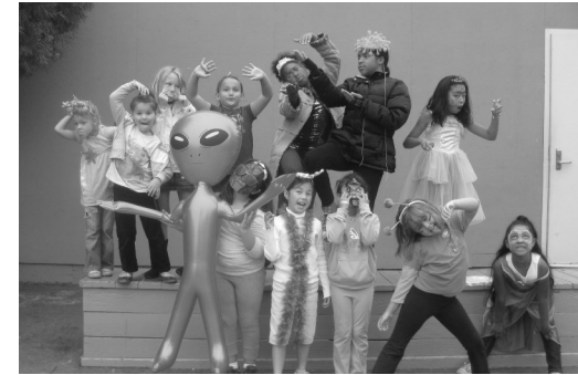
Weekly Themes and Awesome Field Trips!

Contact the Teen Department at 510-521-1743 ext. 208, or check out our website, www.girlsincislandcity.org to find out more information!