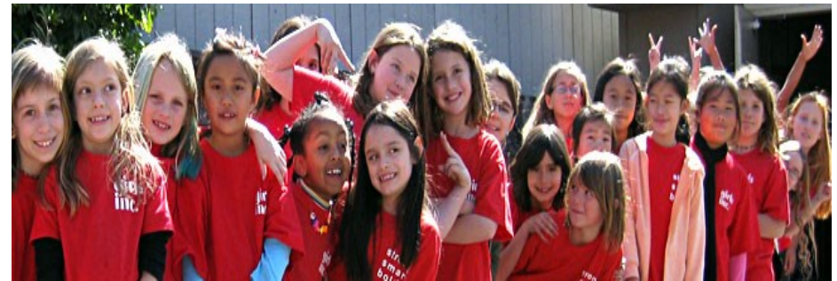
Strong, Smart, and Bold. SM Girls